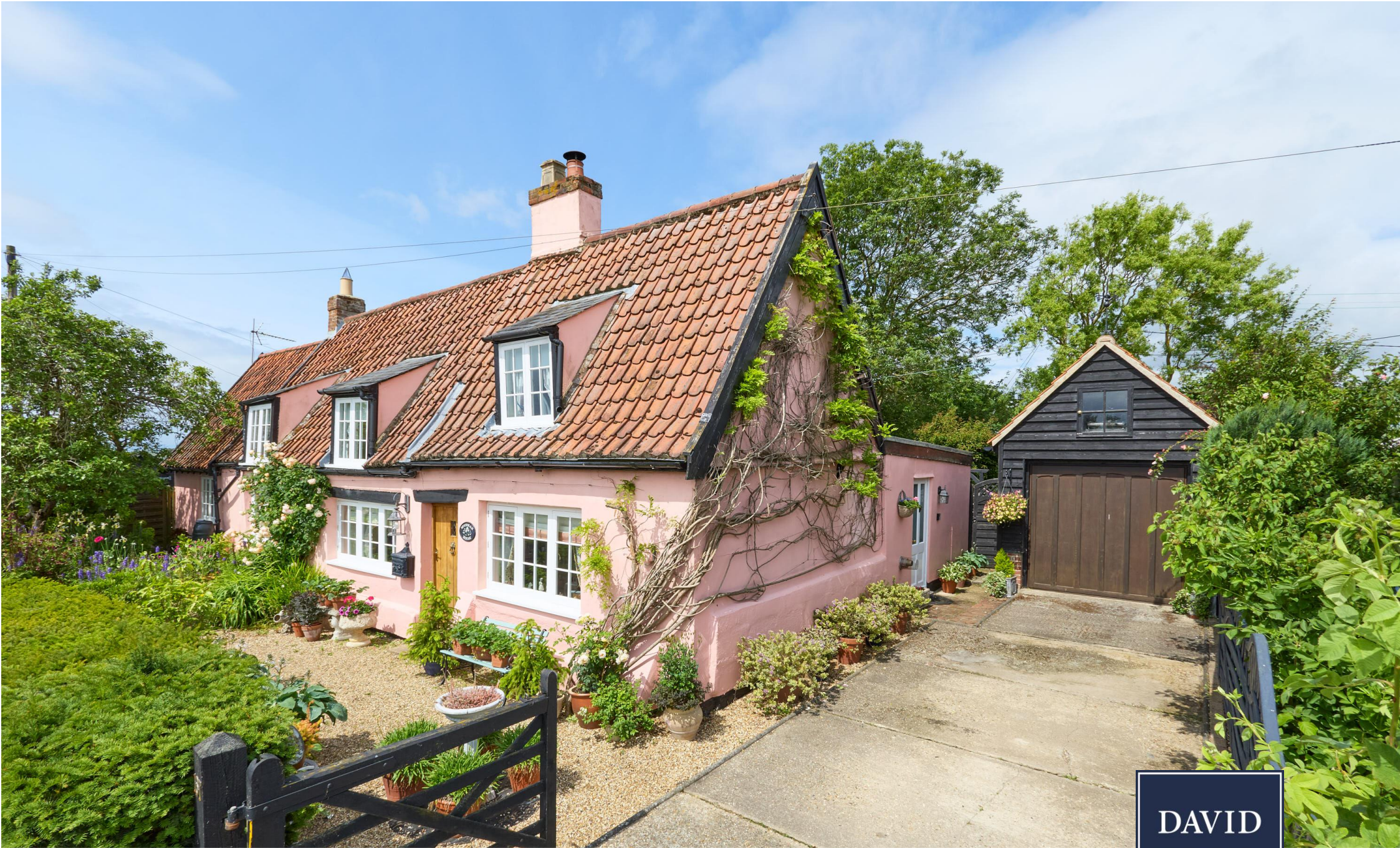
Woodman House, Carlton Green