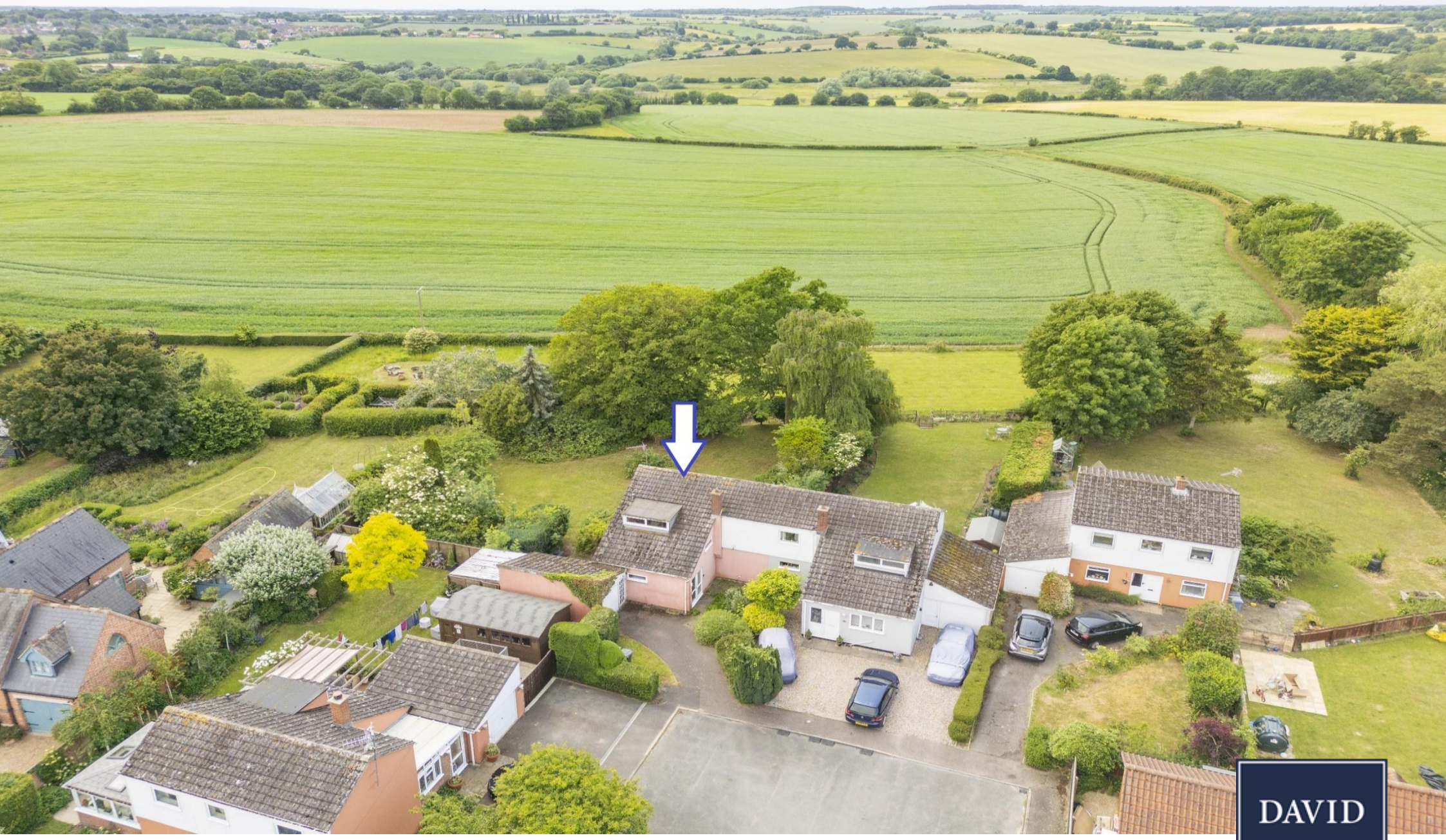
2 Terra Cotta Place, Upper Street, Stanstead, Sudbury, Suffolk