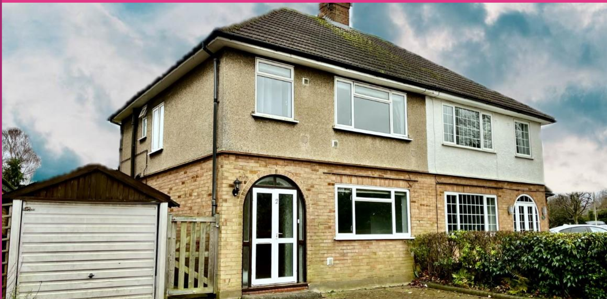
POUNDFIELD, WATFORD - £490,000 3 Bedroom Semi-Detached House