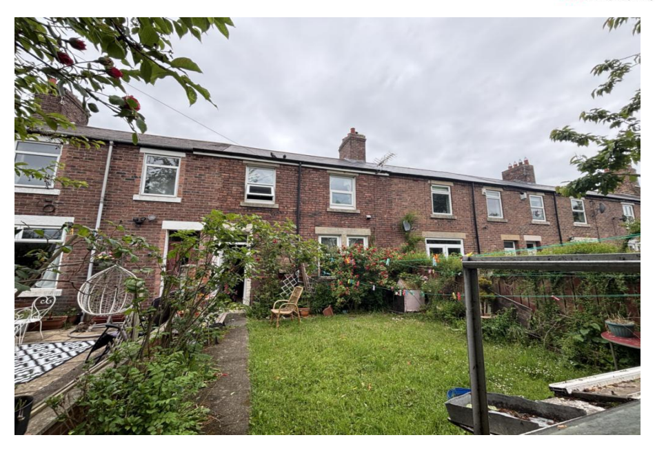
Rising Sun Cottages, Wallsend, Tyne and Wear £235,000

A fantastic chance to purchase a spacious 3 bedroom terraced property at Rising Sun Cottages, Wallsend.