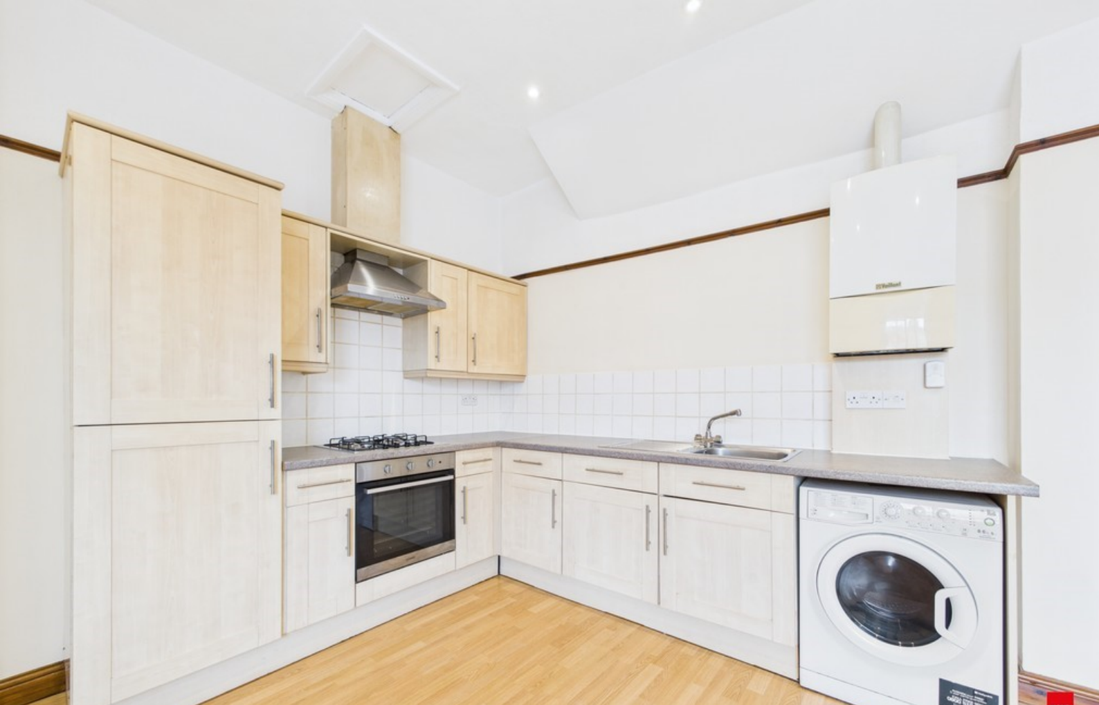
Open Plan Living Room Kitchen