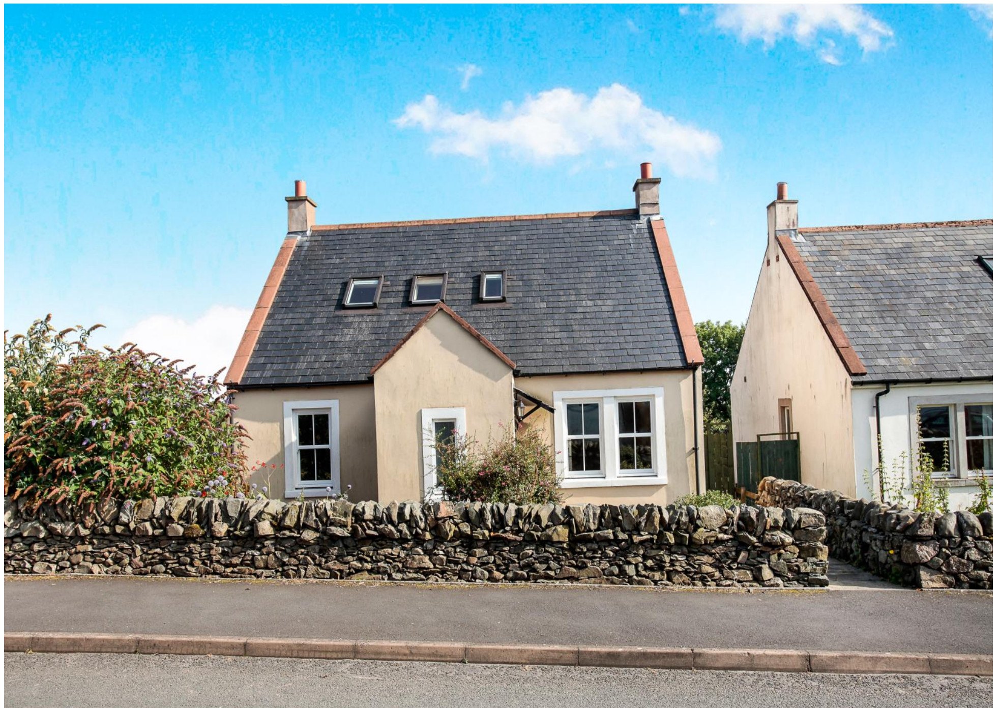
Bramble Cottage St. David Street, Kirkpatrick Durham, Castle Douglas,