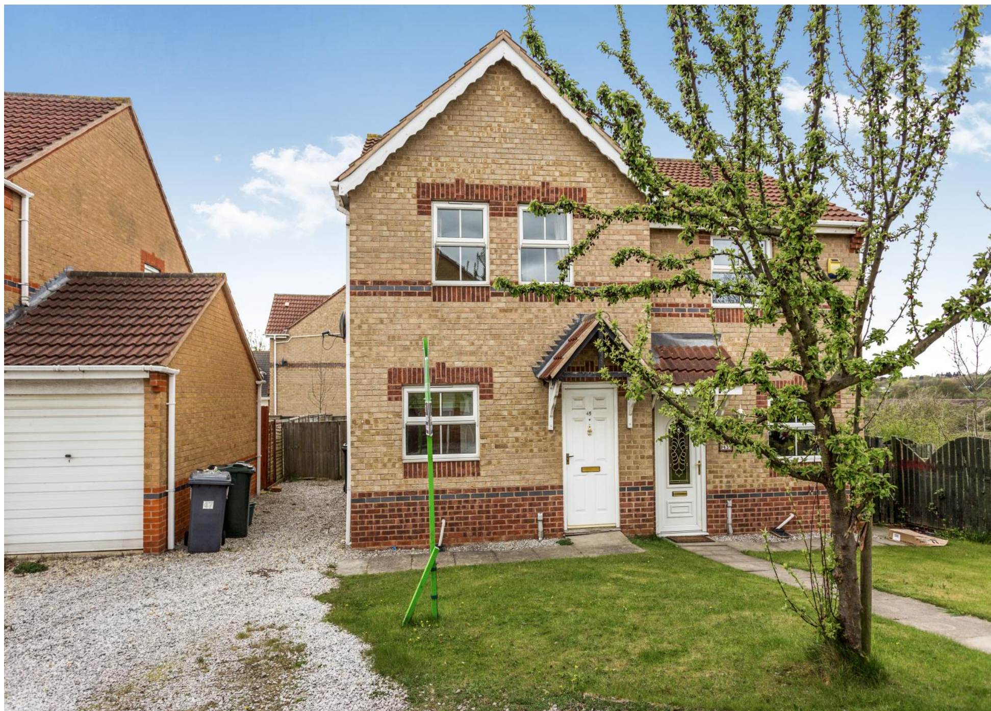
Horse Shoe Court, Balby, Doncaster, South Yorkshire Guide £90,000