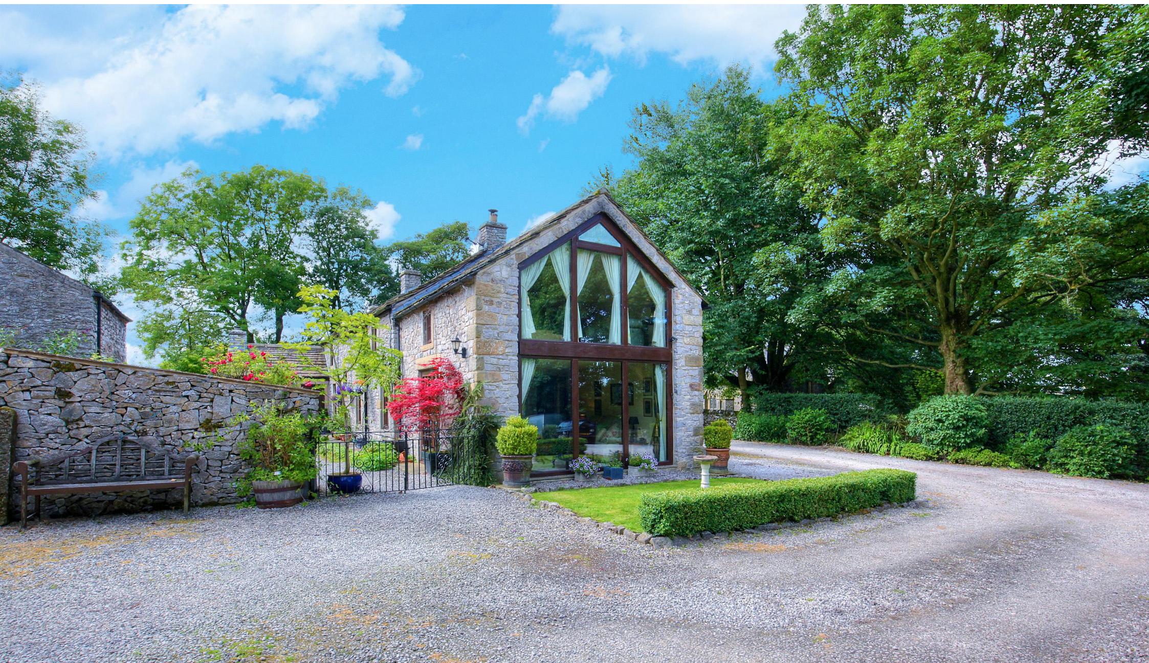
Ash Tree Cottage, Wardlow, Buxton, Derbyshire, SK17 8RP