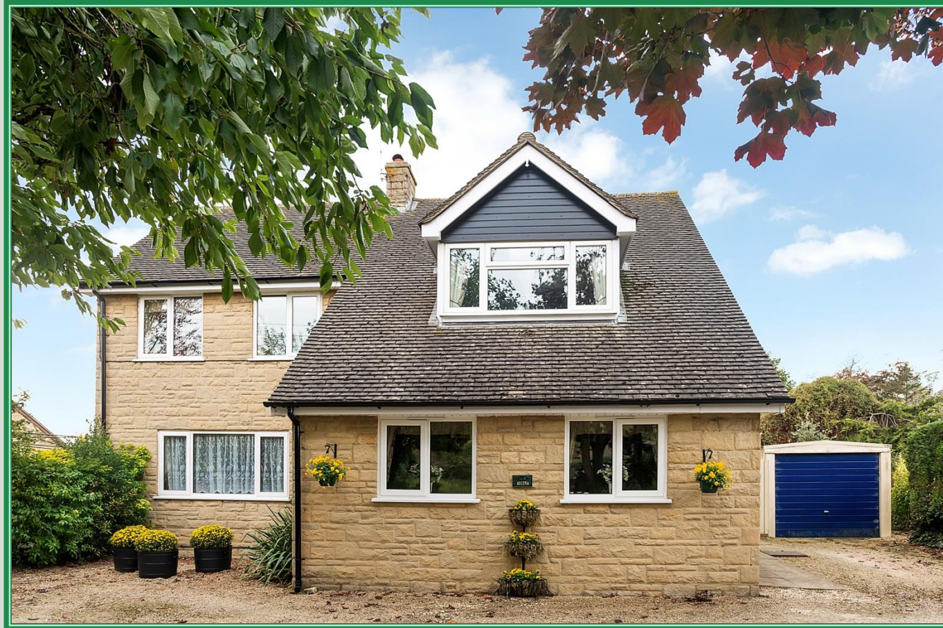
Upper Heyford Oxfordshire