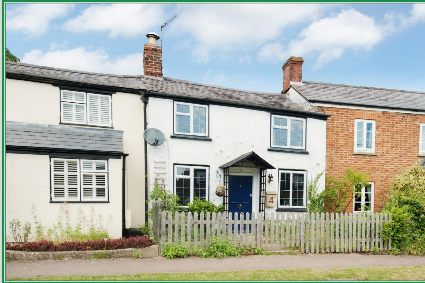
4 Enstone Road, Middle Barton, Chipping Norton, Oxfordshire, OX7 7BN