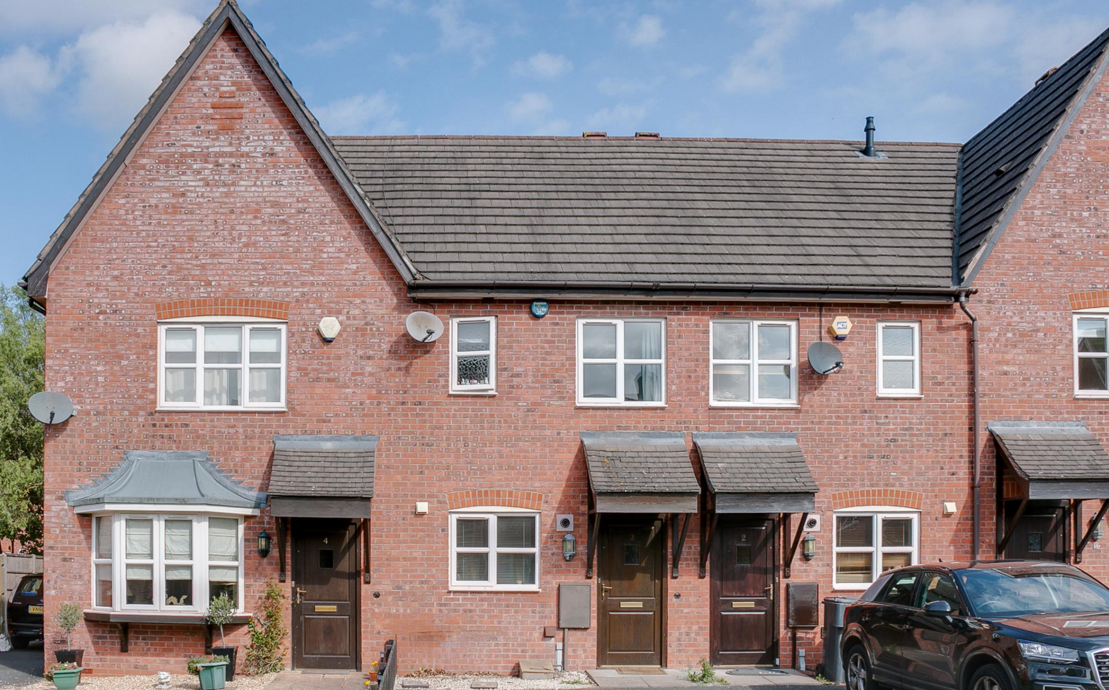
Sedge Drive, Woodland Grange, Bromsgrove, B61 0UL | Offers Over £180,000 Two Bedroom Mid-Terraced House