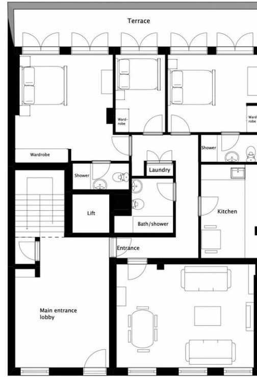
Three Bedroom Apartment Floor Plans