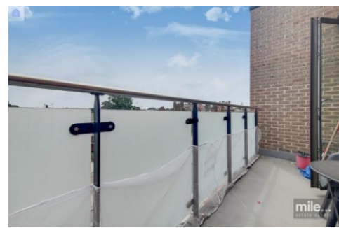
Church Road, London NW10 £375,000 Leasehold

Mile is delighted to offer to the market this amazing two double bedroom apartment situated in this secure development.