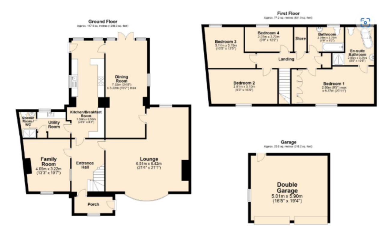
Total area: approx. 224.4 sq. metres (2415.8 sq. feet) Files produced by Vierte & Hergan L. Plant produced using Plantite.