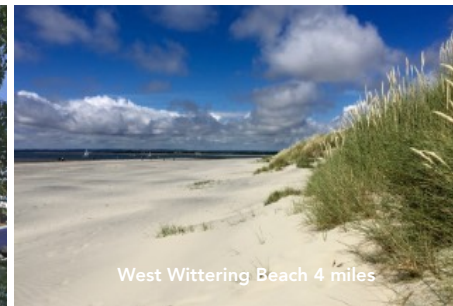
West Wittering Beach 4 miles

Viewings by Appointment Michael Cornish - Chichester