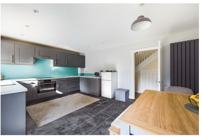
Sloughbrook Close Horsham, RH12 5JD