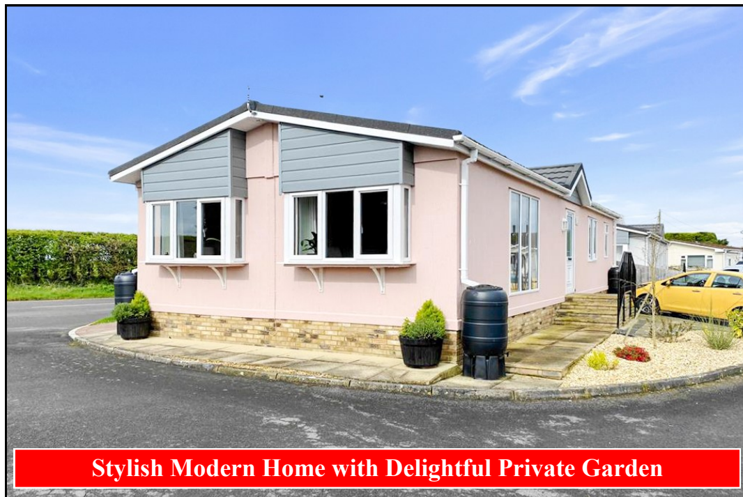
Stylish Modern Home with Delightful Private Garden

1 Orchard Park, West Camel, Yeovil. BA22 7QR