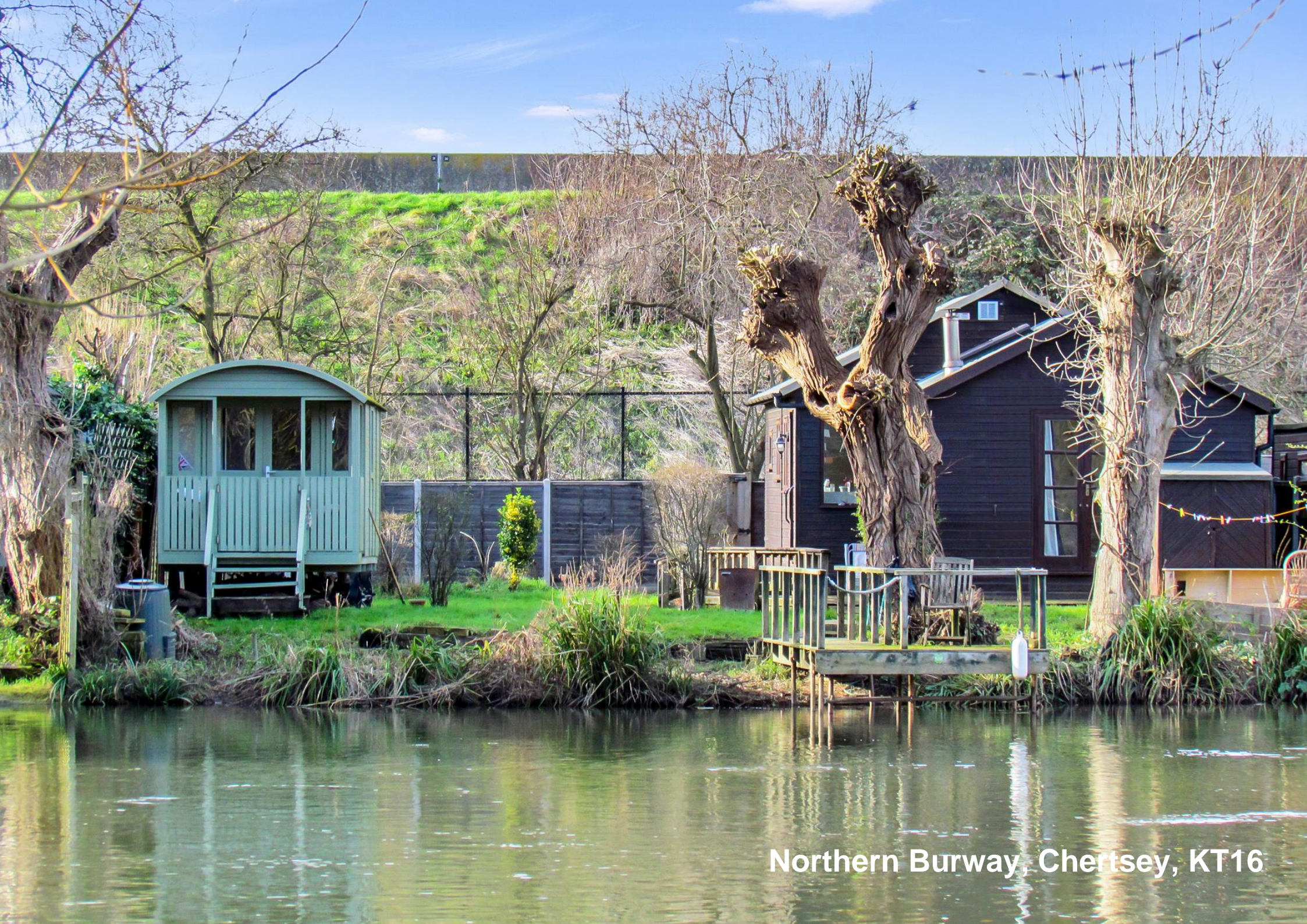
Northern Burway, Chertsey, KT16