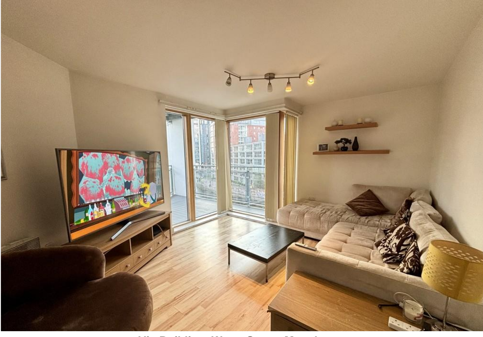
Vie Building, Water Street, Manchester