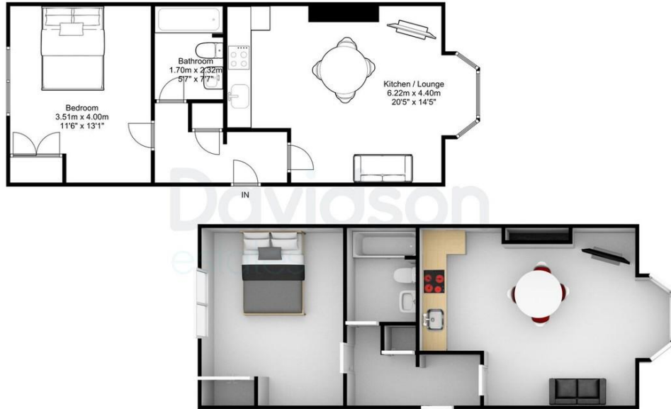
Floorplan measurements are for illustrative purpose only. Floor plan by www.sebastiano.co.uk.

APPROXIMATE GROSS INTERNAL AREA: 503.8 SQ.F / 46.8 SQ.M