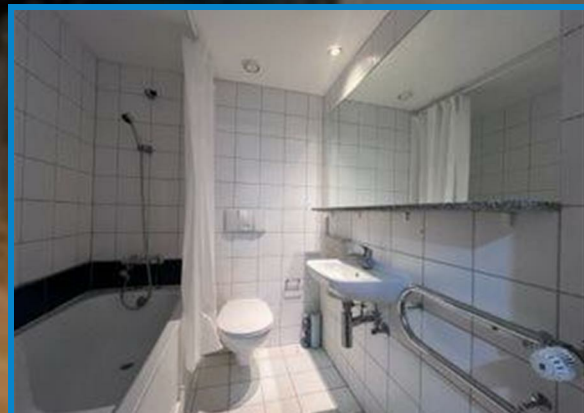
Apartment 187 7 Royal Quay, Liverpool , L3 4EY £950