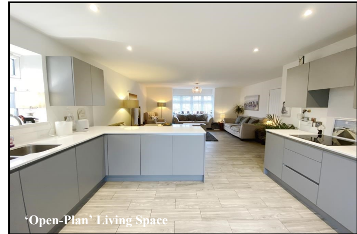
'Open-Plan' Living Space