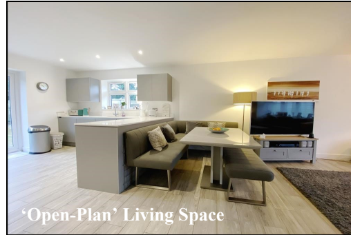
'Open-Plan' Living Space