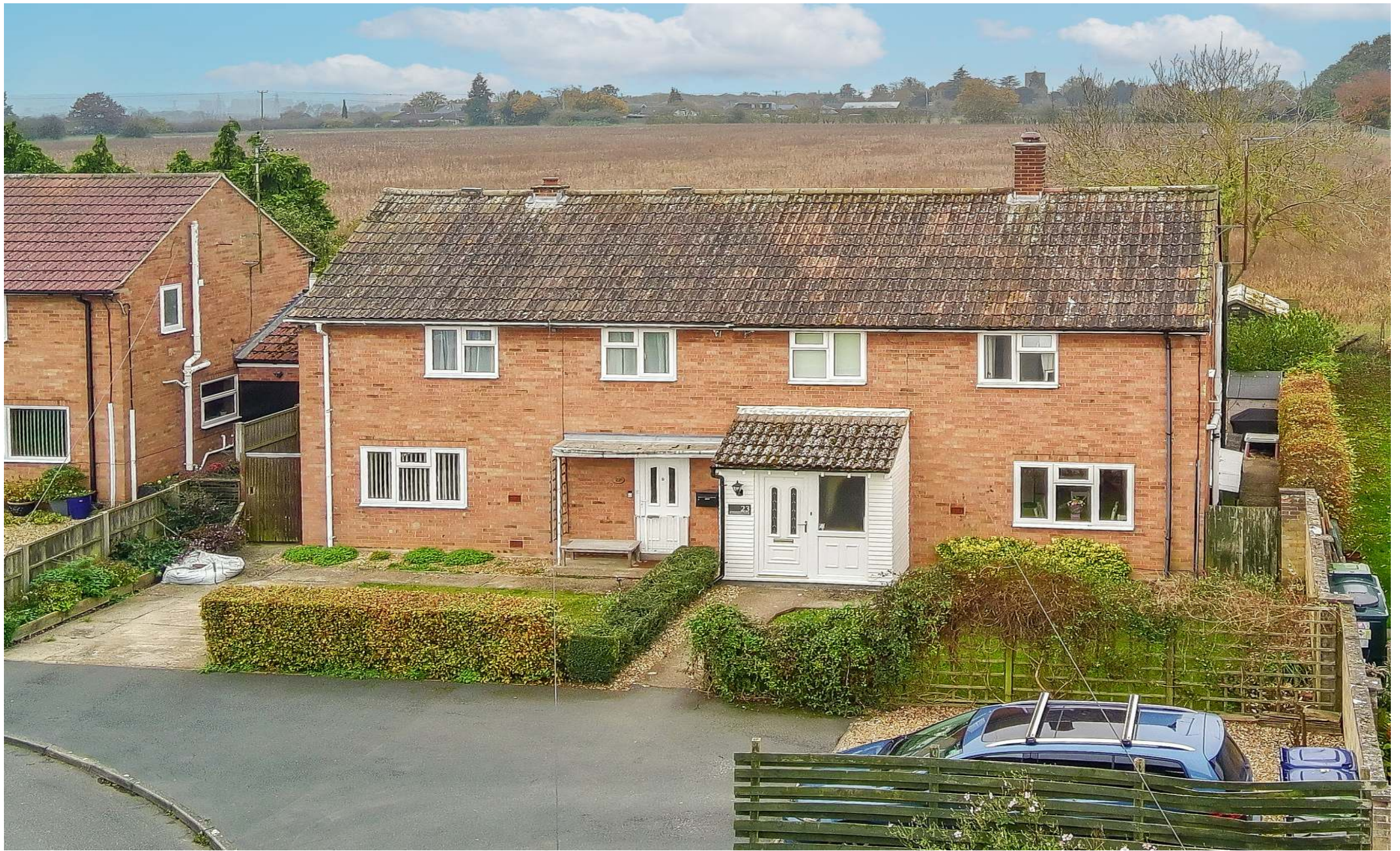
Herrings Close, Stow-cum-Quy, Cambridge, Cambridgeshire