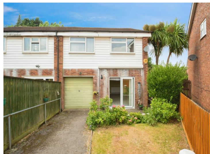
16' x 11' 4" ( 4.88m x 3.45m )