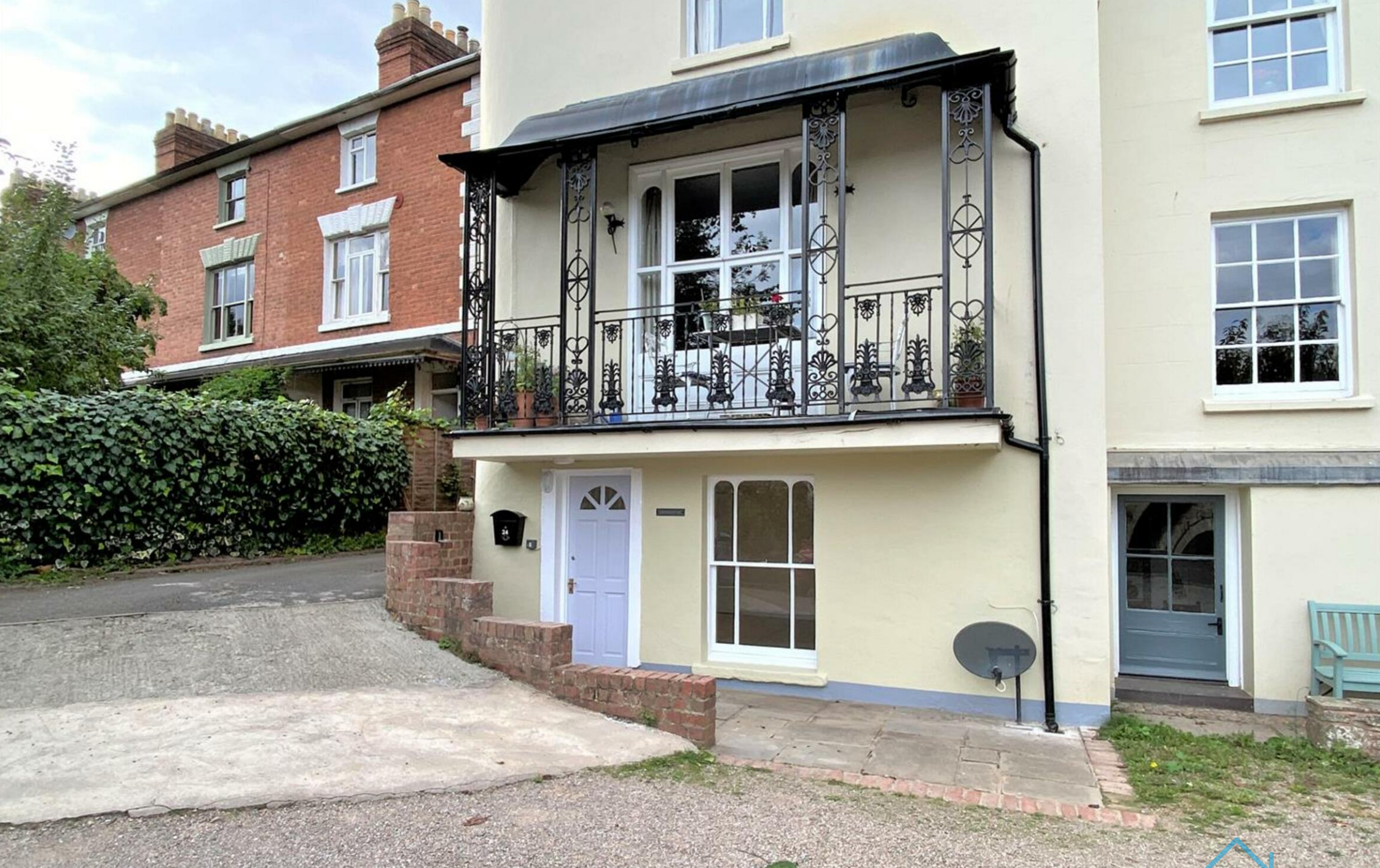
Garden Apartment Wyebriidge House Hereford, HR4 9DG £70,000