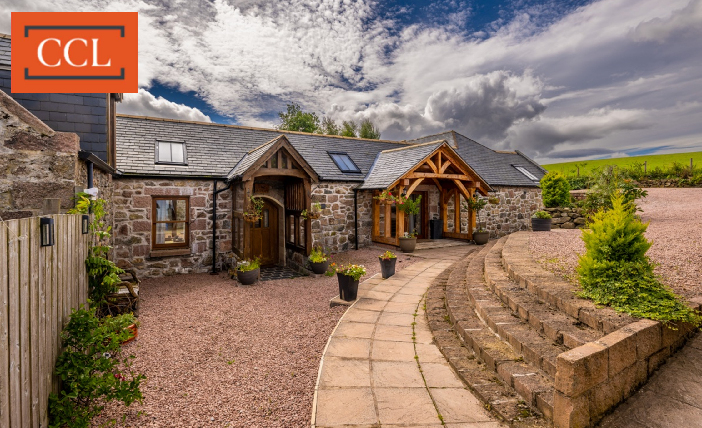
Gateside Steading, Lumphanan, Banchory, Kincardineshire